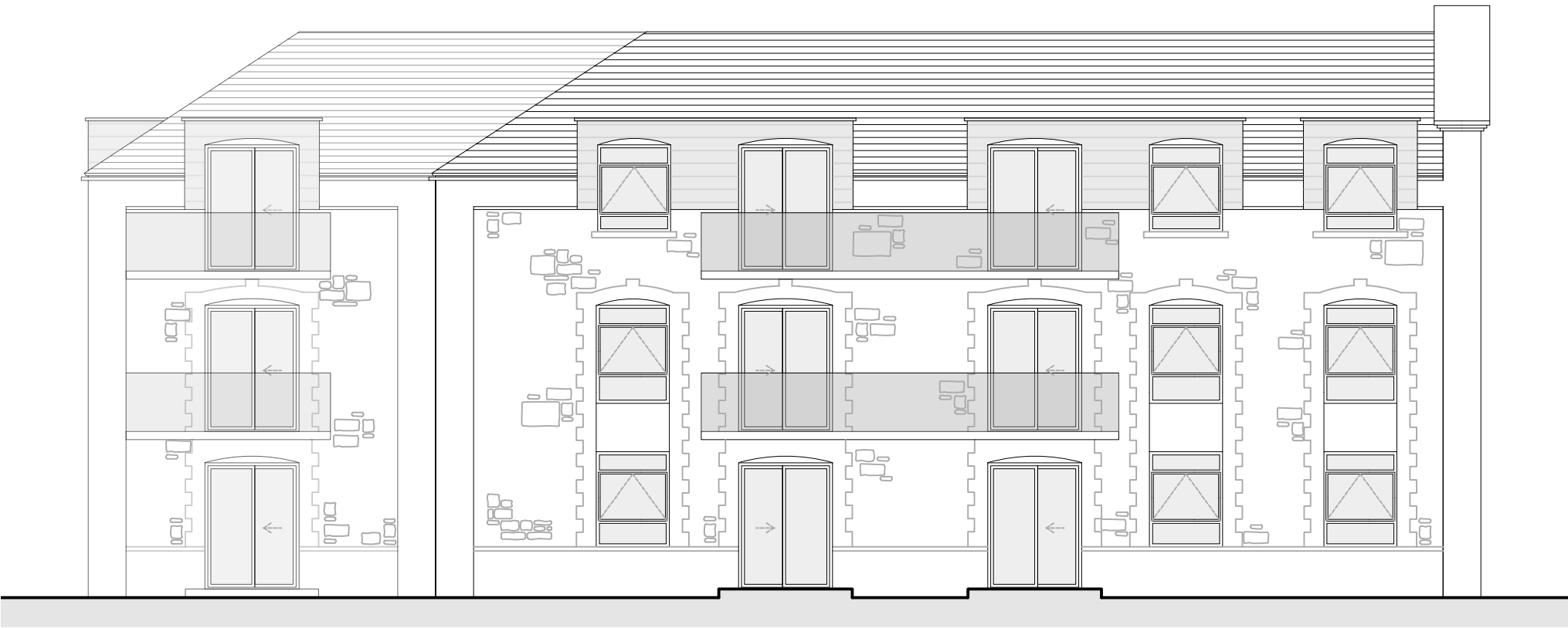
Proposed North Elevation 1:100 @ A2