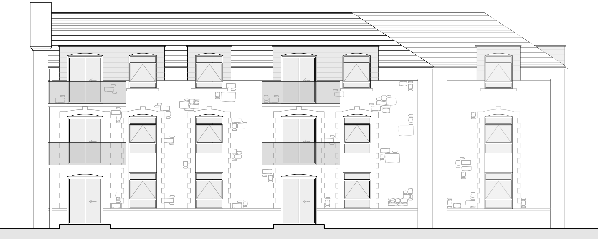
Proposed South Elevation 1:100 @ A2